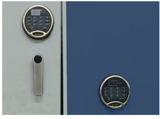
Various Electronic Lock options available

It's just as easy to make change, validate mid-shift deposits, and drop a bank at the end of the day. With the press of one button, cashiers are done using AC7500 in less than sixty seconds.