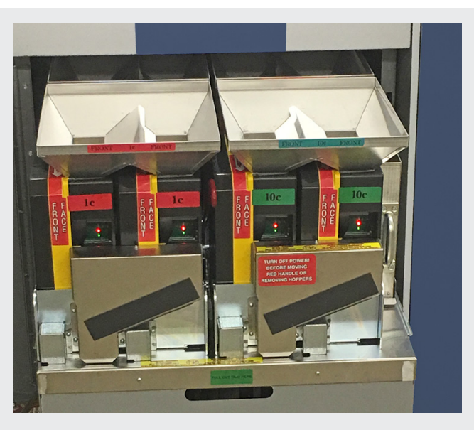
AC7500 Coin Hoppers

Many companies have seen ROI in as little as 12 months